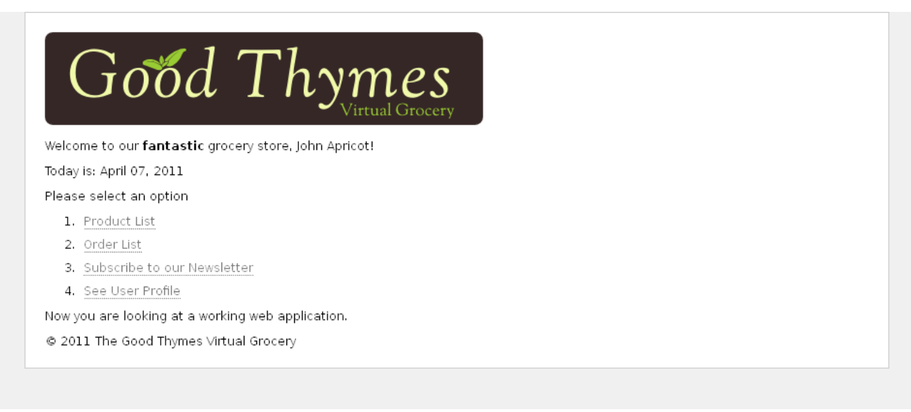
Example application home page

But first let's see how that template engine is initialized.